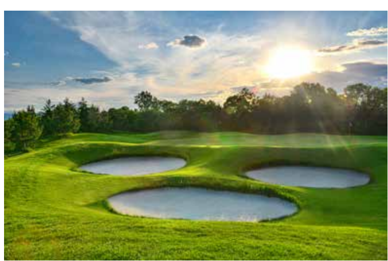
St. Sofia Golf Club