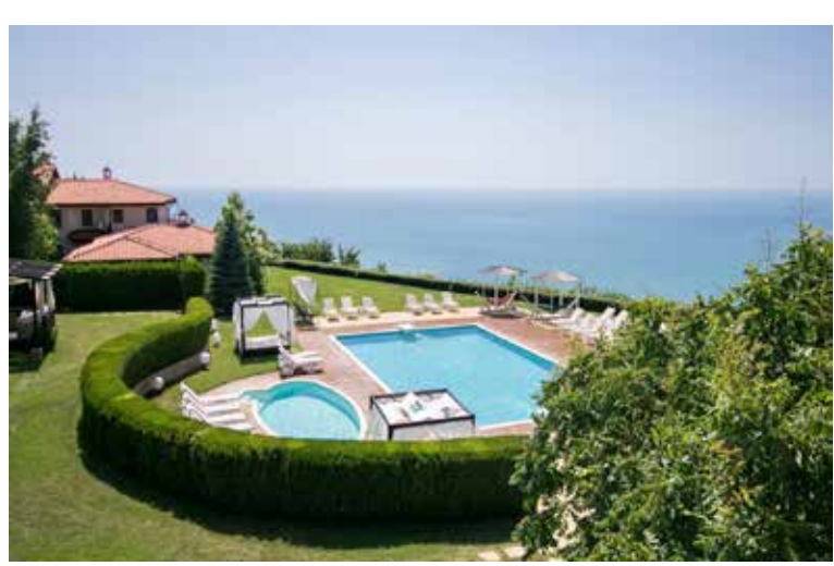
BlackSeaRama Golf & Villas