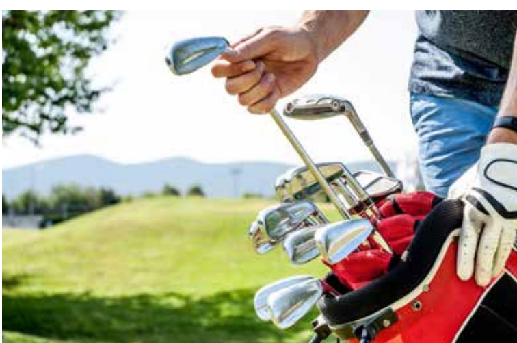
Pirin Golf & Country Club